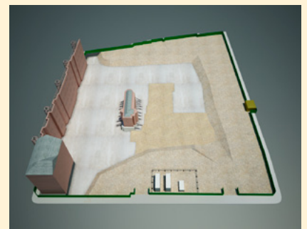
Start of the month