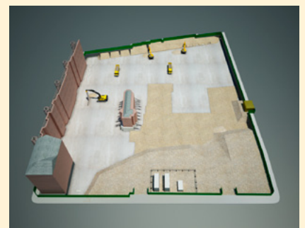
End of the month