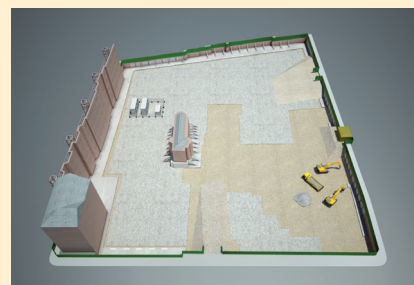
Start of the month