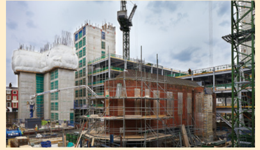
Scaffolding 'bird cage' under construction around the Chapel.