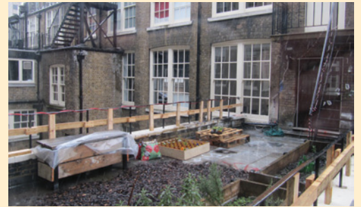
Architectural Association kitchen garden – timber all recycled from Fitzroy Place.