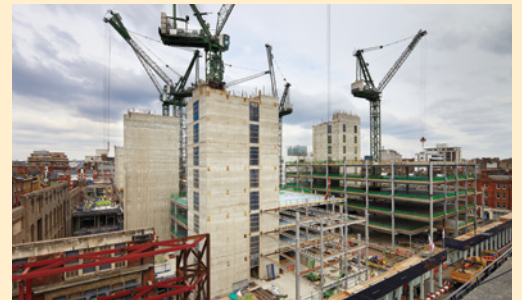
Aerial view from Mortimer Street.