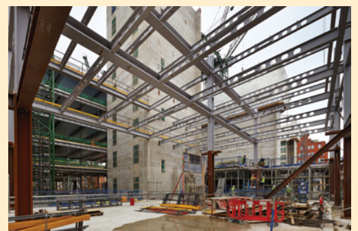
Work continues behind the Mortimer Street gantry.