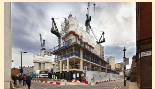
View from the junction of Riding House Street and Cleveland Street.