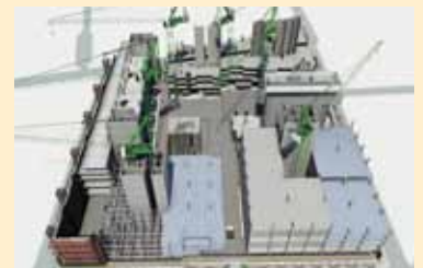
Start of May