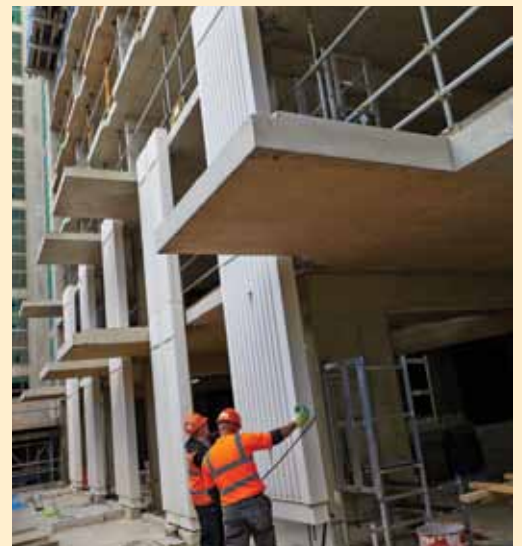
Inside the site: the 1st cladding panels being placed on Block 5a.