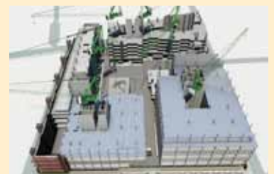
End of May