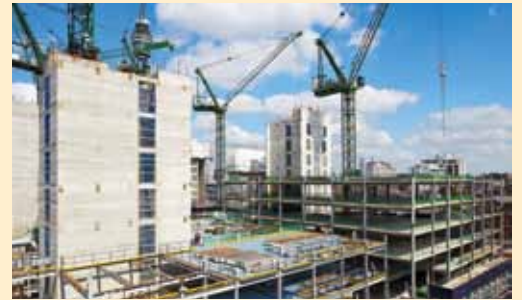
Aerial view from Mortimer Street.