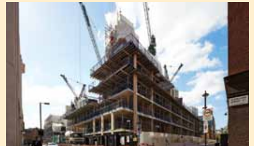
View from the junction of Riding House Street and Cleveland Street.