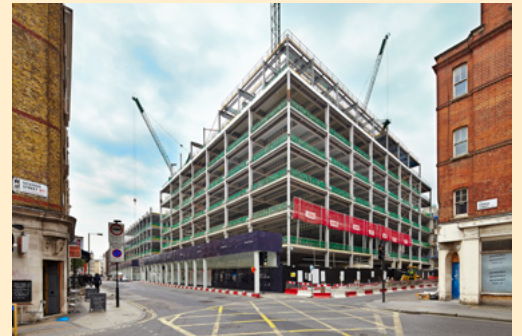
View from the junction of Mortimer Street and Cleveland Street.