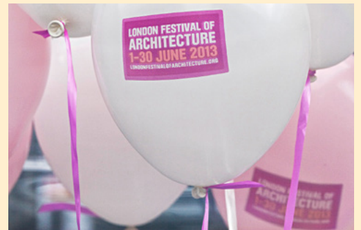
Great Titchfield Festival of Architecture.