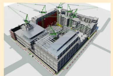
End of July