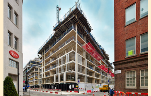
View from the junction of Riding House Street and Cleveland Street.