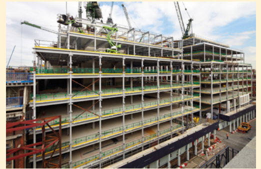
Aerial view from Mortimer Street.