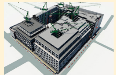
End of August