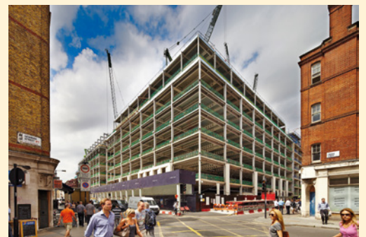
View from corner Mortimer Street and Cleveland Street.