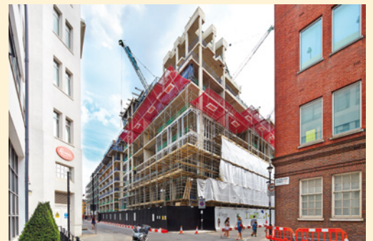
View from Cleveland Street and Riding House Street junction.