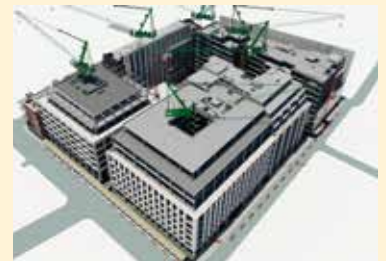
Start of October.