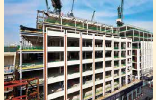
Aerial view from Mortimer Street.