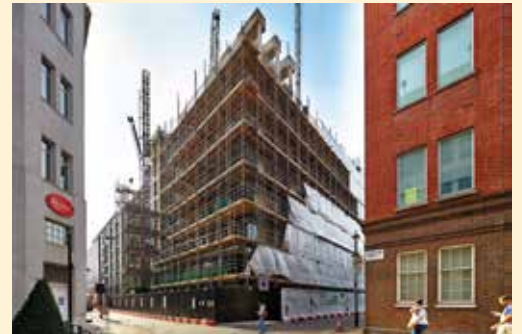
View from the junction of Riding House Street and Cleveland Street.