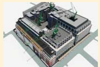
End of October.