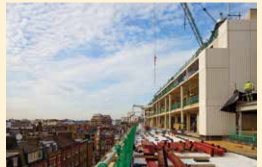
Cladding panels to the roof of Block 5.