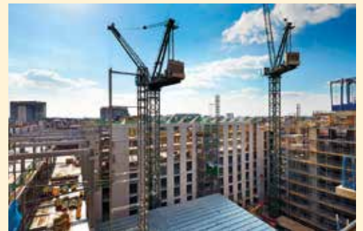
Cladding panels and glazing on the east side of Block 5.