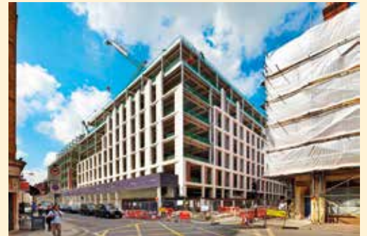
View from the junction of Mortimer Street and Cleveland Street.