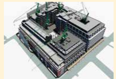
End of September.