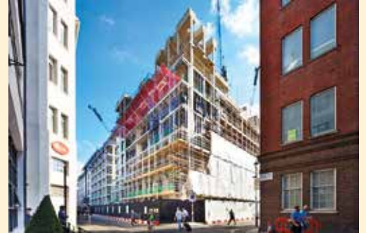
View from the junction of Riding House Street and Cleveland Street.