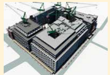
Start of September.