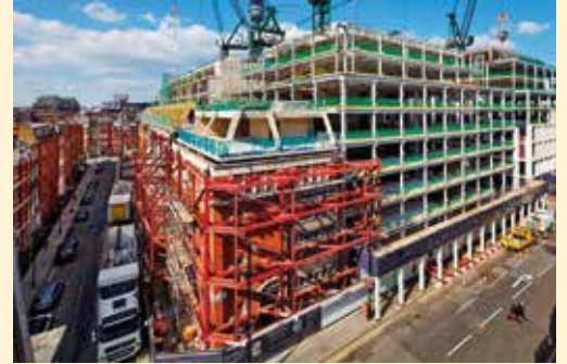
Aerial view from Mortimer Street.