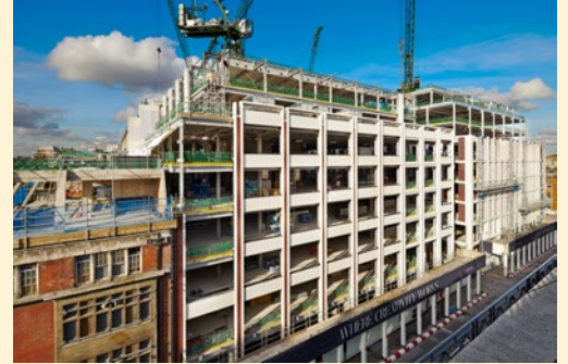
Aerial view from Mortimer Street.