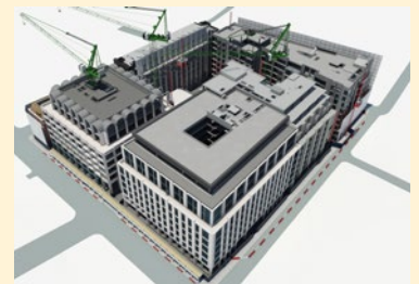
End of November.