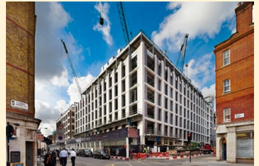
View from the junction of Mortimer Street and Cleveland Street.