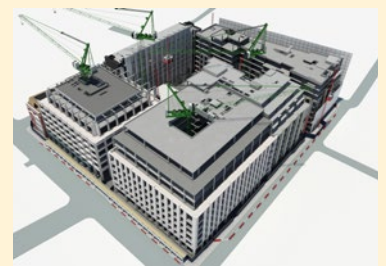
Start of November.