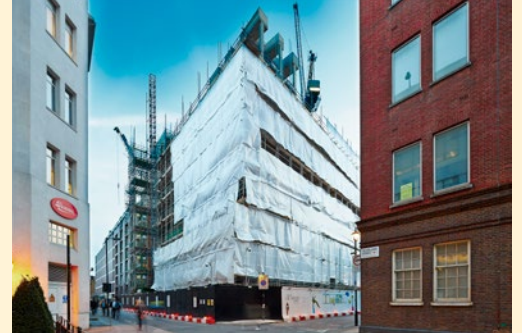
View from the junction of Riding House Street and Cleveland Street.