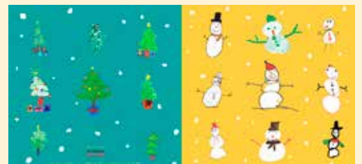
Christmas cards on sale in support of All Souls Primary School.