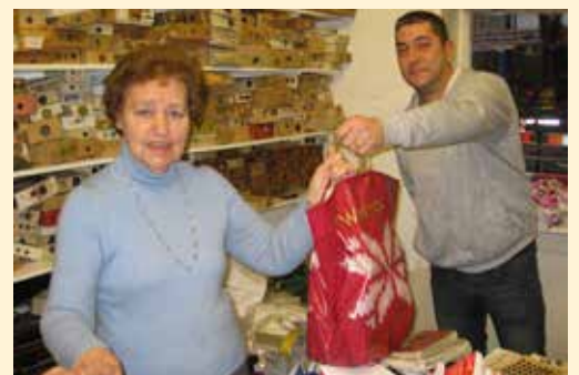
Once again this year Christmas gifts are being delivered to Fitzrovia pensioners in conjunction with the Fitzrovia Neighbourhood Association.