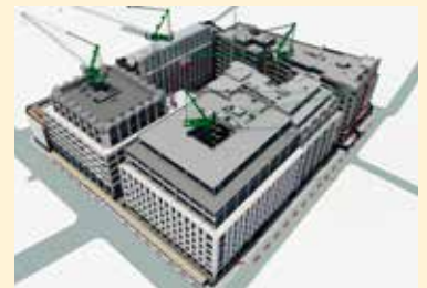
Start of December.