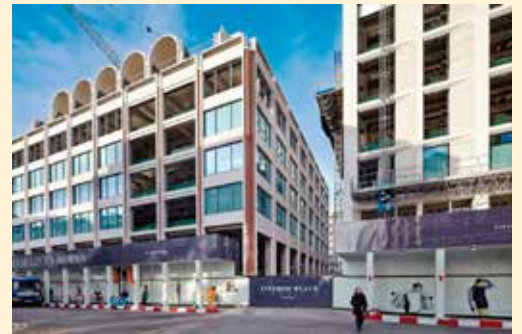
View from Berners Street.