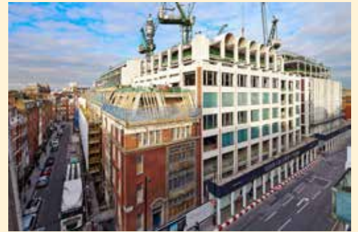
Aerial view from Mortimer Street.

Season's Greetings from all at Fitzroy Place.