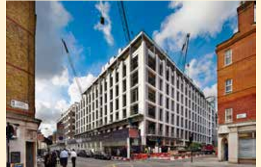
View from the junction of Mortimer Street and Cleveland Street.