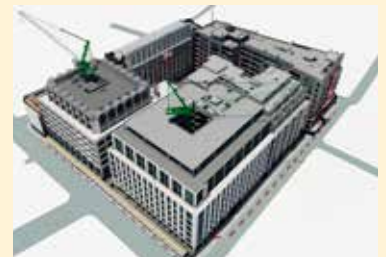
End of December.