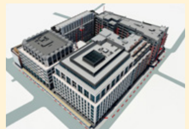
End of February.