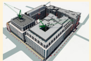
Start of February.