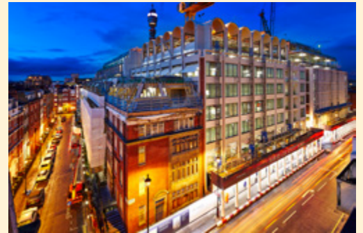
View from the junction of Mortimer Street and Cleveland Street.