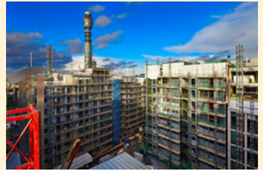
View of the courtyard looking towards the BT tower.