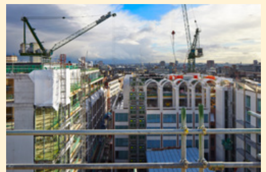
View towards Mortimer St from Riding House St at high level.