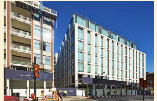
View of Office Block 1 from Berners St.