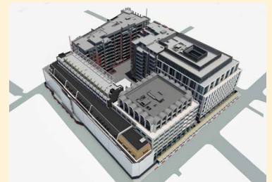
End of April