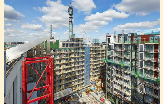
View of the courtyard looking towards the BT tower.