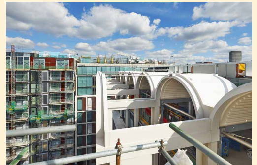
View of Nassau St & Mortimer St.