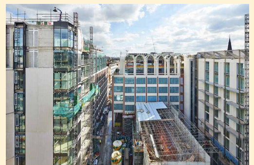
View across the site looking south.