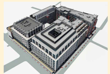
Start of April