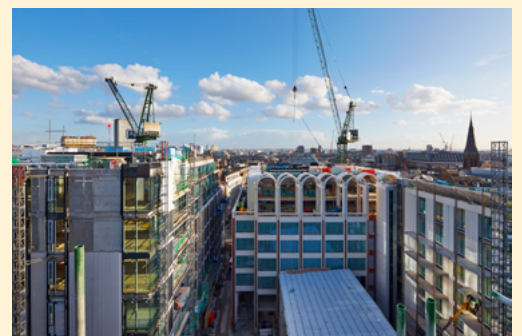
View towards Mortimer St from Riding House St at high level.