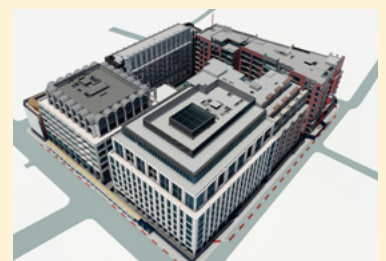
End of March