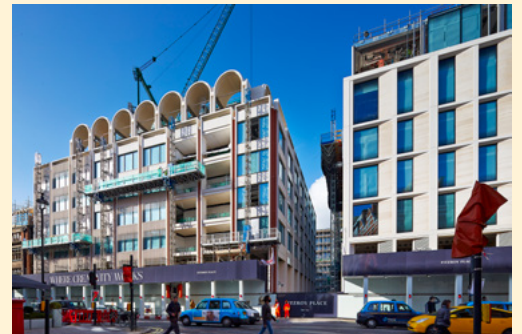
View from the Berners St.