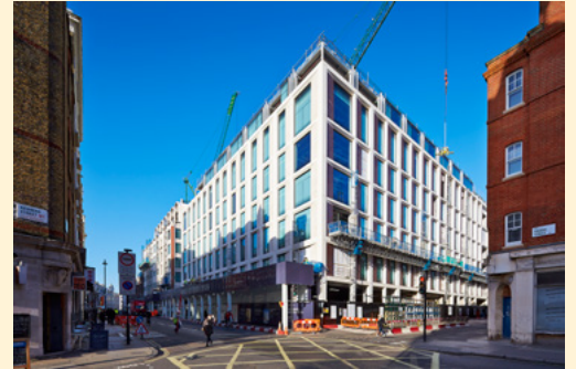
View from the Mortimer St and Cleveland St.