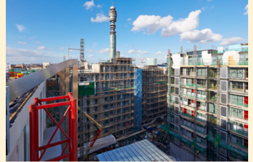
View of the courtyard looking towards the BT tower.