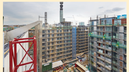
Courtyard view of Block 6,7 and 8.