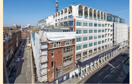
View of Nassau St & Mortimer St.