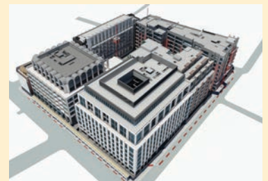
Start of May