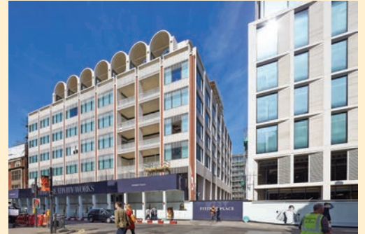
Office Block 2 from Berners St.