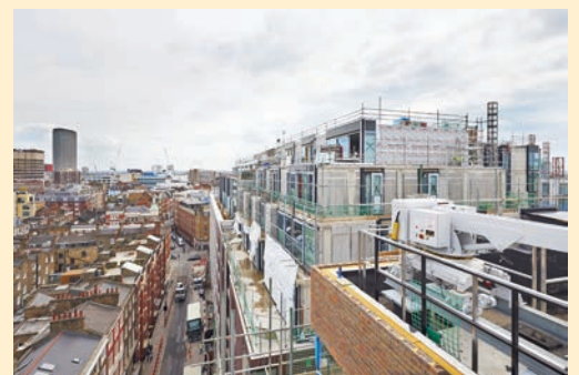
View down Cleveland St from Block 8.