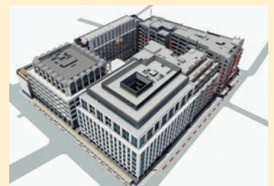
End of May