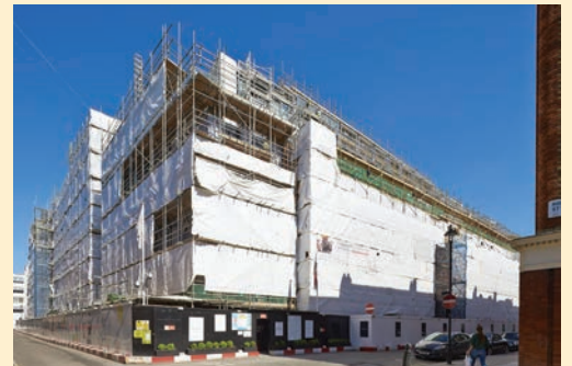
View from the junction of Nassau St and Riding House Street.