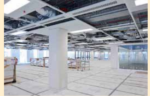
Office Block 1 – floorplate