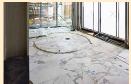
Office Block 2 reception flooring underway