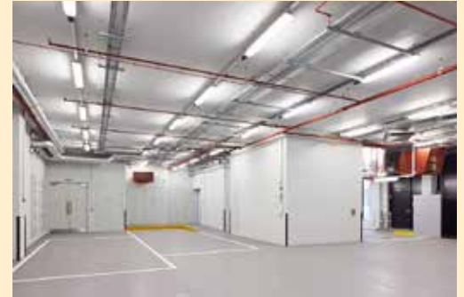
Cleveland St loading bay