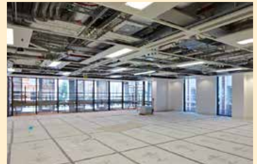
Office Block 1 looking towards Berners St from the 1st Floor