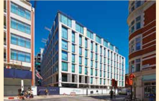
Office Block 1