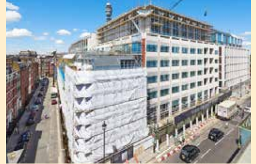
View of Nassau St & Mortimer St.