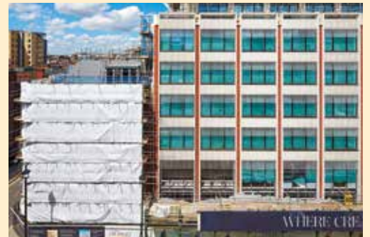
No 10 Mortimer St sheeted for restoration