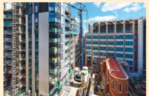
Looking south from Riding House Street