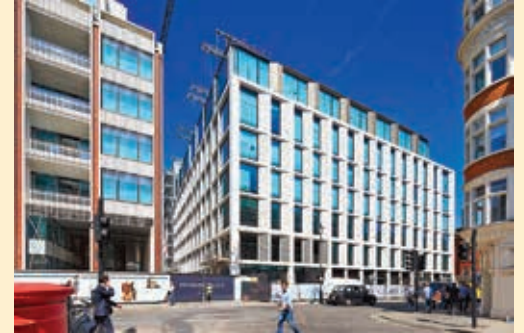
Office Block 1 – cladding complete to Level 6