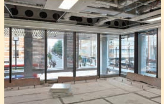
View from 1st floor of Office Block 1 looking down Berners St