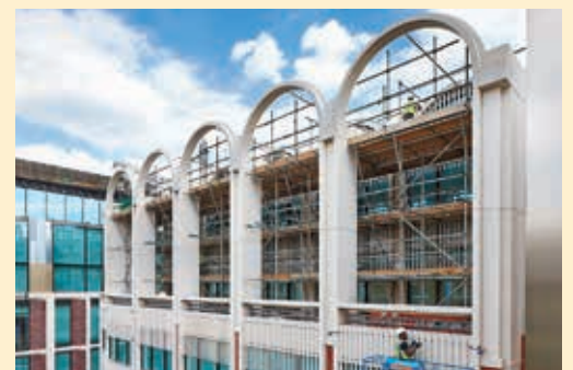
Detail of the upper floors of Office Block 1 (courtyard façade)