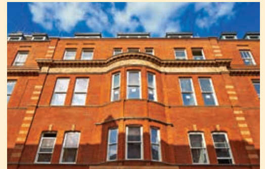
Restored Nassau St façade