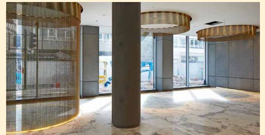
Office Block 2 reception