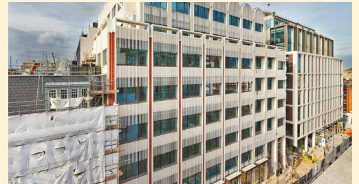
Paving well underway in front of Office Blocks 1 & 2 on Mortimer St