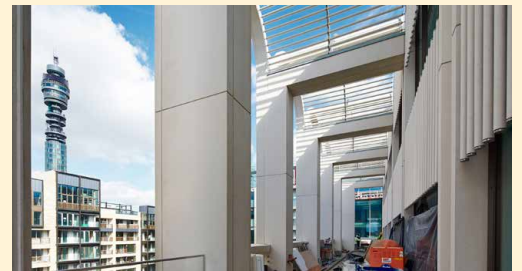
Baguettes completing to North elevations of the office block 2