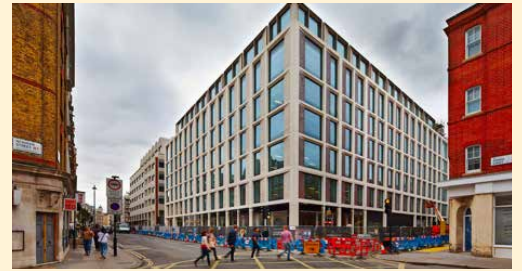
Office Blocks 1 & 2 from Mortimer St Cleveland St Junction