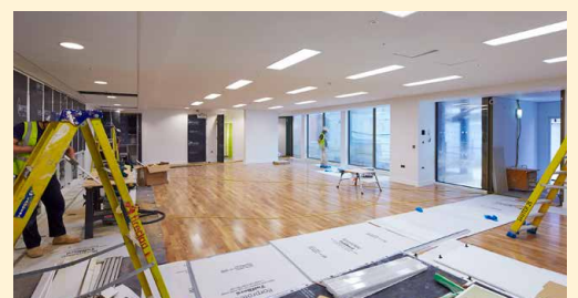
Education facility for All Souls Primary School