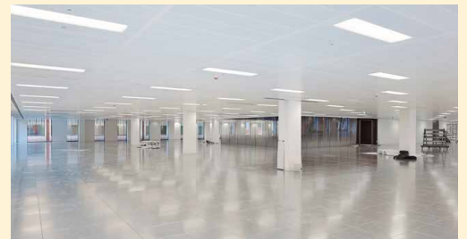
Typical floor in Office Block 1