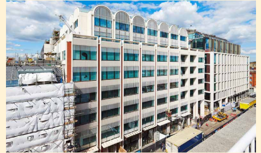
View of Office Blocks 1 & 2 on Mortimer St