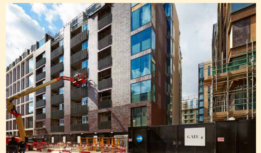
Block 8 Cleveland St