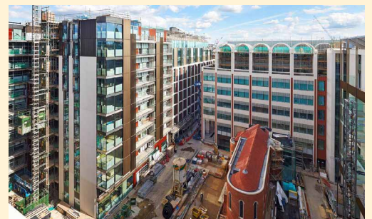
Courtyard view of Block 8 and the North elevations of the office blocks