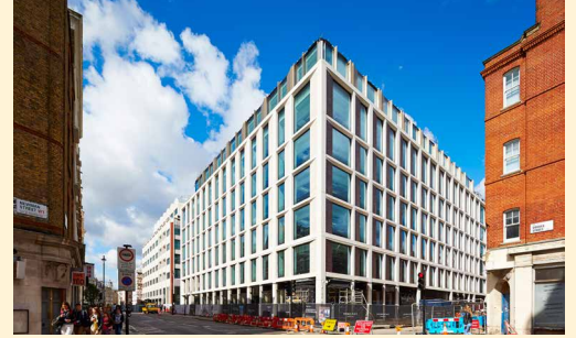
Office Block 1 – cladding completes