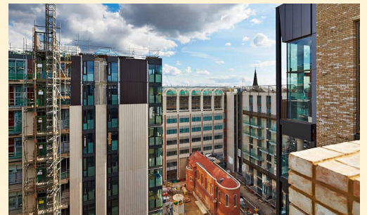
Restored chapel and courtyard from Block 7 looking south