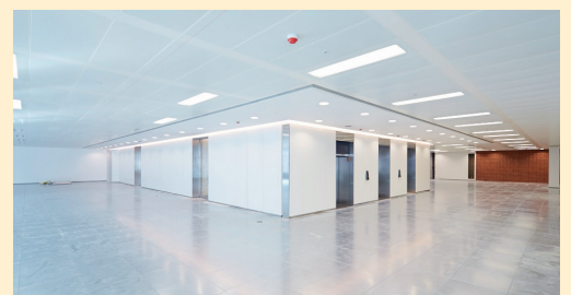
Office Block 2 typical floor plate