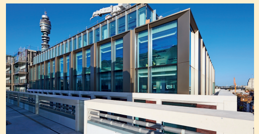
Office block 1 balcony