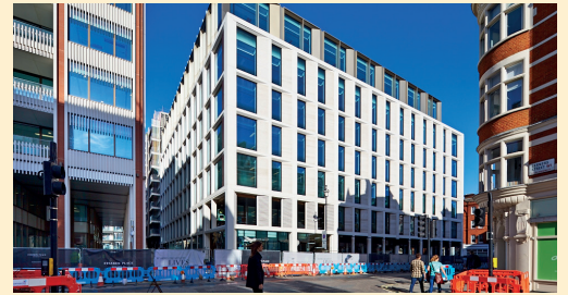
Office Blocks 1 from Berners St