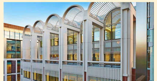
Office block 2 roof terrace from the courtyard