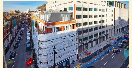
Mortimer St Nassau St junction