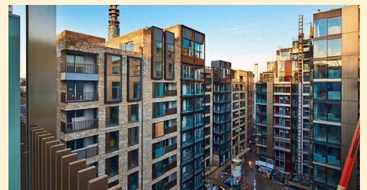
Residential blocks 6 & 7