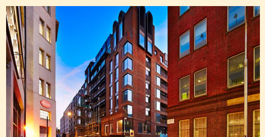
Cleveland St Riding House St junction