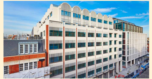
Office Blocks 1 & 2 on Mortimer St