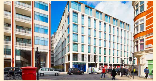
Mortimer Street / Nassau Street