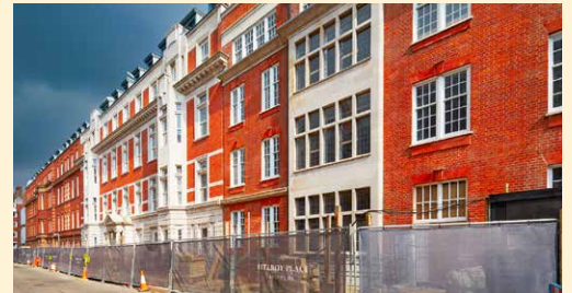
Nassau Street Façade