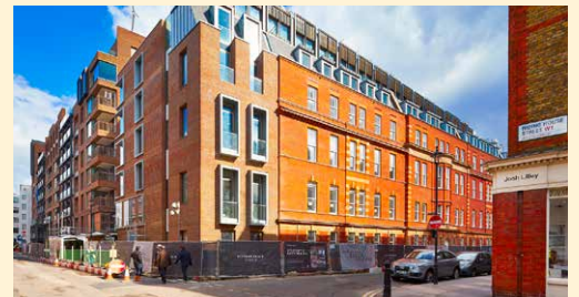
Riding House Street Nassau Street Junction