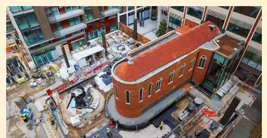
Waterproofing and Hard Landscaping Underway