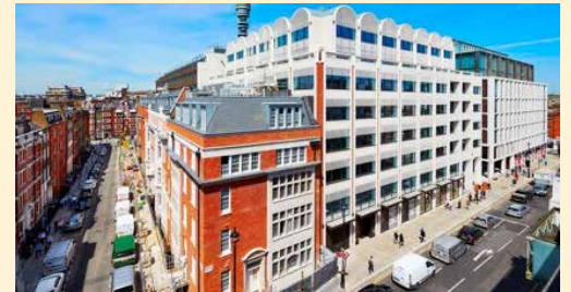
Nassau St / Mortimer St