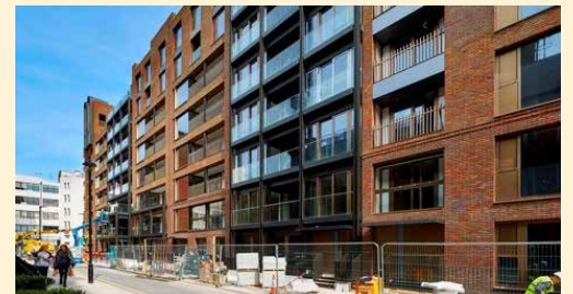
Riding House St