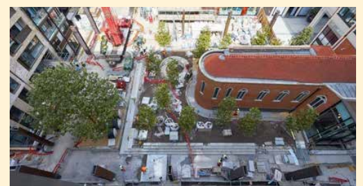
Courtyard landscaping completing to the west