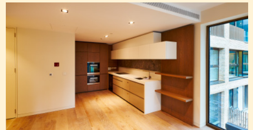
Block 6 apartment